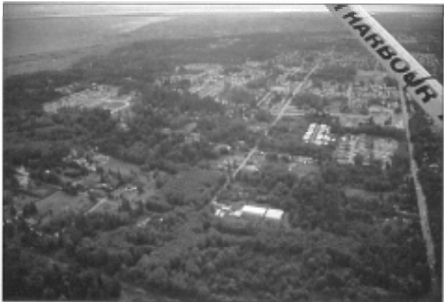
Right: The site as it appears now in an aerial photo.