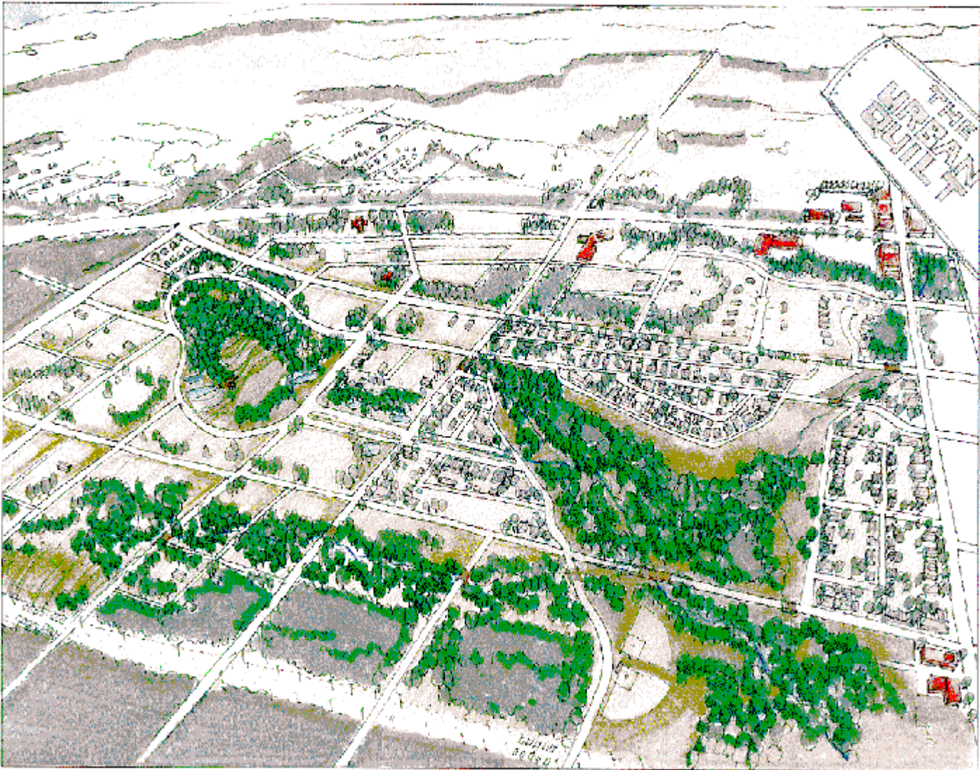
Below: A drawing of what it might be like ten years from now. The new road pattern is in place, and the public recreation and natural area system has been established. Certain neighbourhoods are shown at full density. Commercial centres are shown in red.