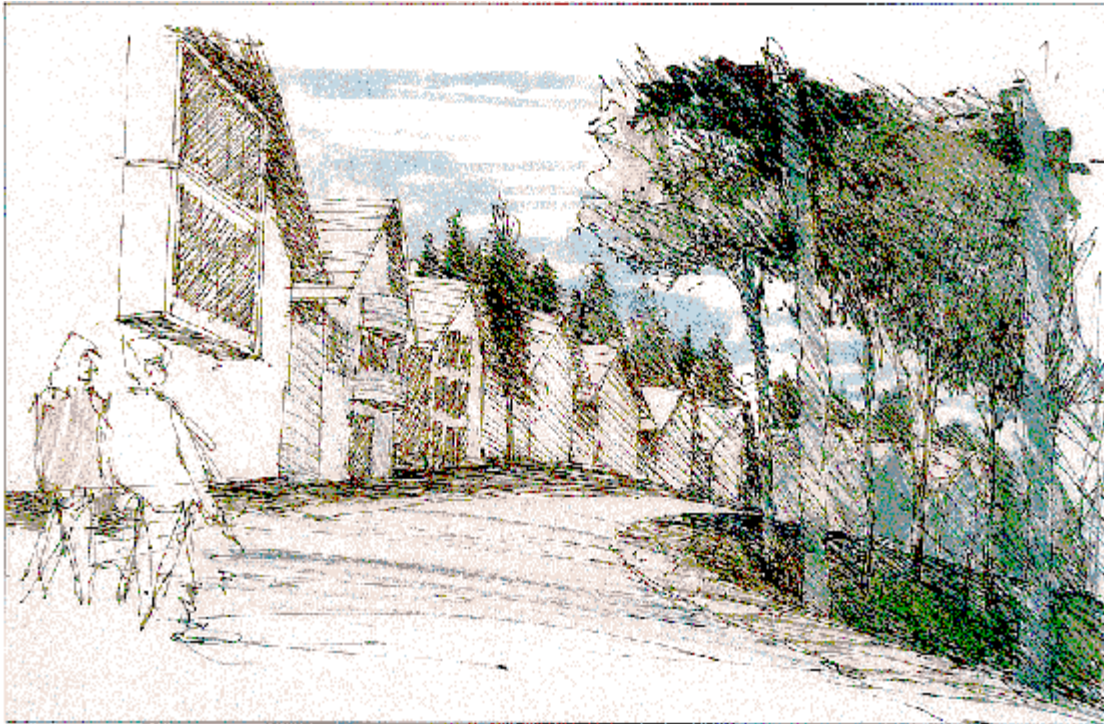
Left: Perspective view of one of the high-density residential areas situated at the edge of a natural area. Presently, natural seepage of ground-water occurs just below where the street edge is shown. Here, and at other locations in our proposal, the natural ground-water system has been incorporated as a positive feature of the design. This enhances the ecological function of the site, saves construction costs, and avoids such problems as flooded basements.