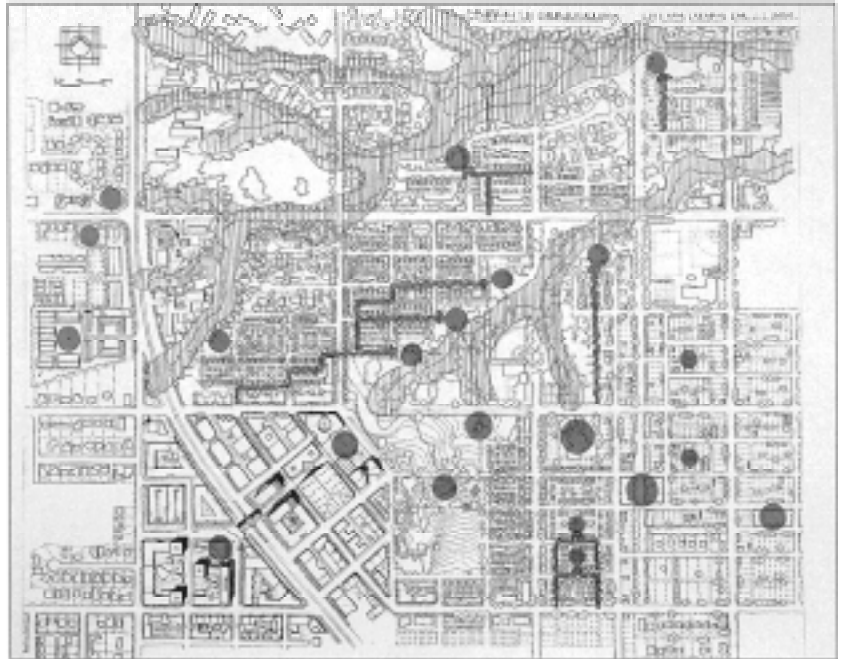
Above: Simplified diagram of the overland storm-drain system. The storm-water is channelled overland in roadside swales (shown as blue dashed lines), to detention areas (shown as large blue dots). From there, the clean water is slowly released back into the nearby stream.